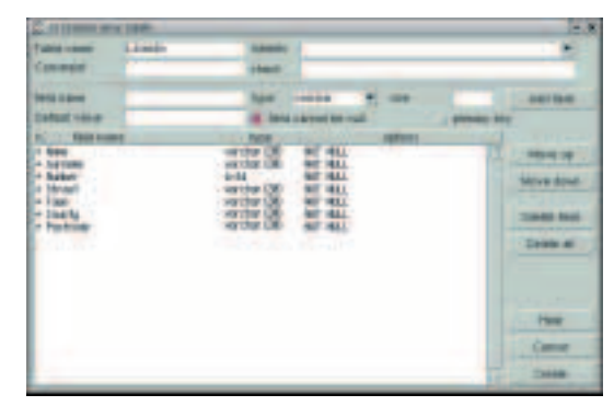
Figure 3: The relation "LivesIn"

You've now created a database on your PostgreSQL server that is ready for you to use. Double-clicking on a table opens it and enables you to edit its content. The great thing is that you've not had to use any SQL